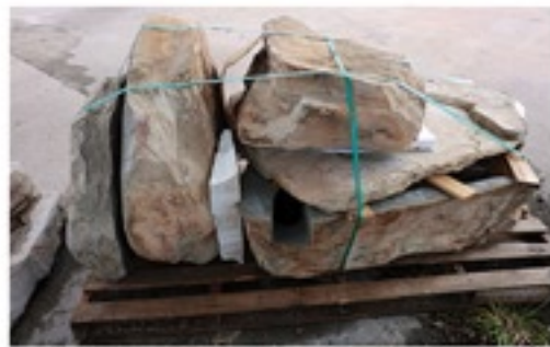
Kit comes palletized on a 7 ft skid. 5 cast rock pieces, weight 1,200 lbs