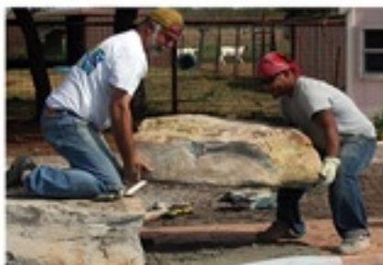
The heaviest piece is about 200 lbs. For pool installations it is recommended that all cast pieces be mortared to a concrete deck and mortared together. Small pieces can be secured with construction adhesive.