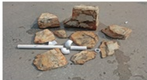
7 small cast pieces, 2" pvc for plumbing column and hollow rocks to hide pipes as shown below are included in kit. Three color options.