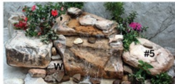
The cap rock #5 was placed on the boulder to the right in this install. Wedge piece is shown between left boulder and center base piece, not used in a radius application. The 3 large boulders and the ledger piece can be moved around as needed.