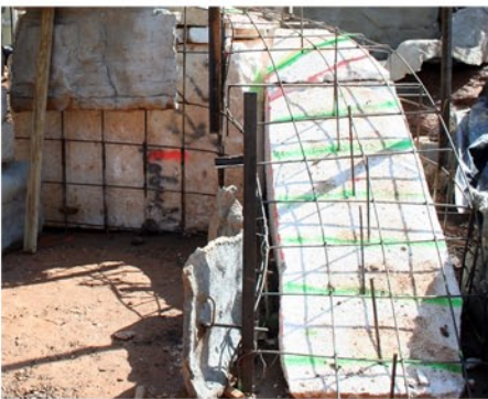
1. set foam ramps. 2. rebar grid. 3. tie castings and Risers with wire inserts on back.

Two foam blocks cut at a 45 angle without rebar grid are included. The foam blocks can be cut with a tie wire "saw" to fit the space. Rebar grid should be anchored to a concrete pad or footings may be required by a local engineer. Note that the steps and rail may not meet local codes. Sample engineering is available.