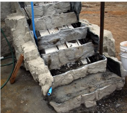
4. backfill with concrete 5. hand texture gaps and treads 6. color with RicoRock Acrylic Stains