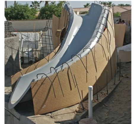
Pegboard is a good inside form for concrete backfill.