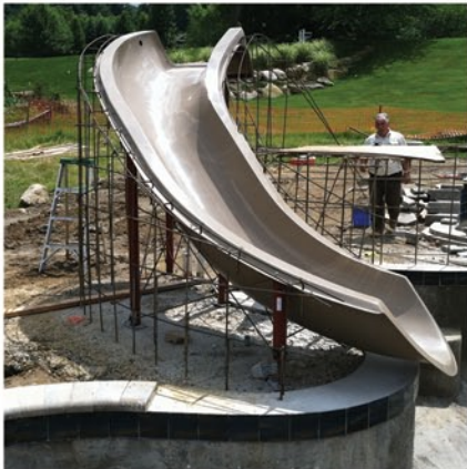
First set slide flume with steel supports from manufacturer or weld custom angle iron frame.