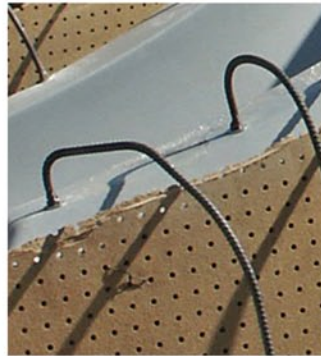
Rebar dowels with bolt ends are secured to slide flange and tied into rebar dowels secured to concrete slab. All-thread works but does not bend as well.