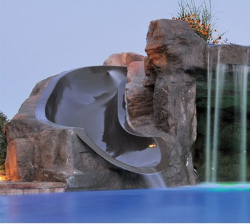
Dolphin Waterslide by Minks Landscape, KY One piece slide about 6 ft high, 15 ft long dolphinwaterslides.net