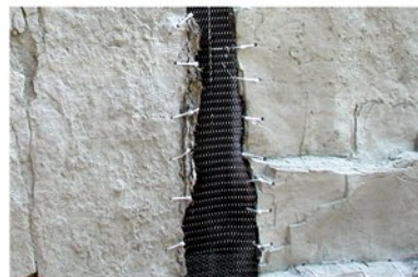
Castings are tied to rebar frame using #9 wire inserts on back of castings. Metal lathe is used between gaps. Backfill with concrete mix, protecting slide with plastic sheeting. Gaps between castings need to be hand textured.