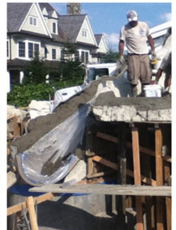
Castings are tied to rebar frame using #9 wire inserts on back of castings. Metal lathe is used between gaps. Backfill with concrete mix, protecting slide with plastic sheeting. Gaps between castings need to be hand textured.