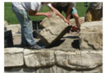
Set side boulders & mortar gap with base piece.