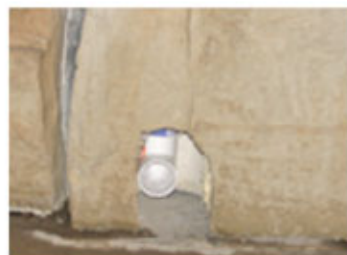
Connect plumbing at back of base piece. Hide pipe with long hollow piece (cut to fit.)