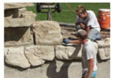
Mortar cap rocks. Clean excess mortar & rake joints about 1/2 inch.