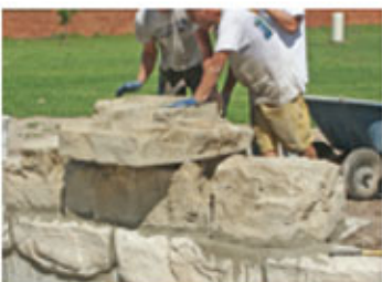
Set basin on 3/4" mortar bed. Level from left to right. Match up plumbing & concrete holes.