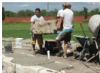
Base piece weighs 150 - 200 lbs. Use thick mortar bed.