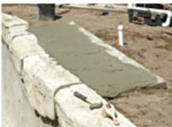
Waterfall pad for 3 Ft. Modular should be 7 feet wide, 30" front to back.