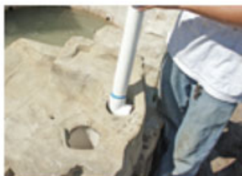
Drop plumbing sleeve in hole. Tighten threaded plug if you plan to pressure test line.