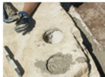
Fill concrete column w/ concrete.