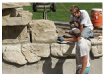
Mortar cap rocks. Clean excess mortar & rake joints about 1/2 inch.