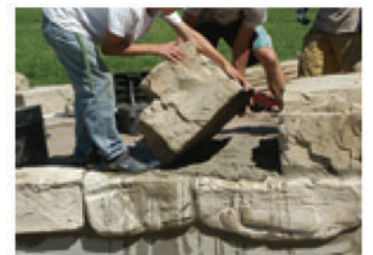
Set side boulders & mortar gap with base piece.