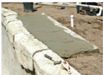
Waterfall pad for 3 Ft. Modular should be 7 feet wide, 30" front to back.