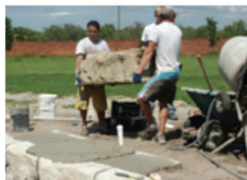
Base piece weighs 150 - 200 lbs. Use thick mortar bed.