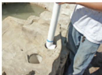
Drop plumbing sleeve in hole. Tighten threaded plug if you plan to pressure test line.