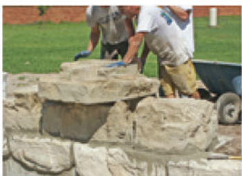
Set basin on 3/4" mortar bed. Level from left to right. Match up plumbing & concrete holes.