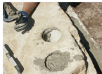
Fill concrete column w/ concrete.