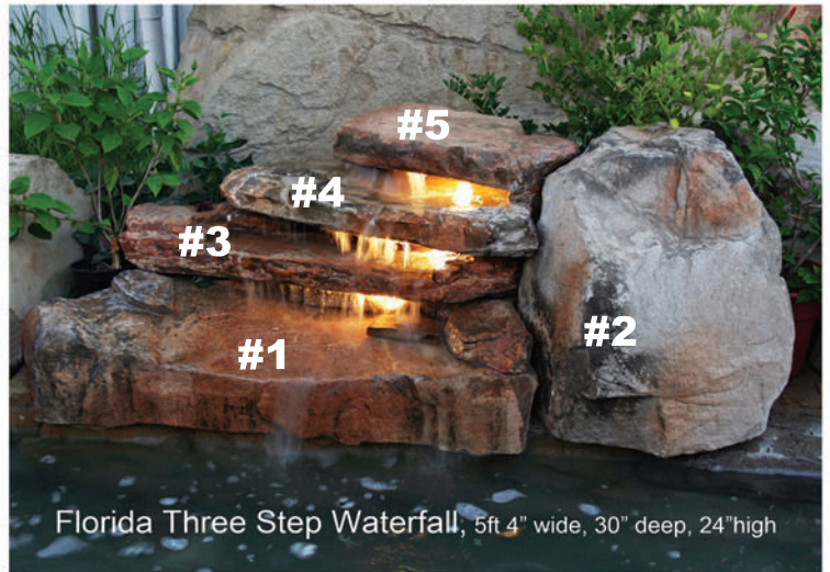
Florida Three Step Waterfall, 5ft 4" wide, 30" deep, 24" high

A simple waterfall for a pond, pool or pond less feature. Can be installed with mortar like our Modular Waterfalls or with Construction Adhesive as shown here.