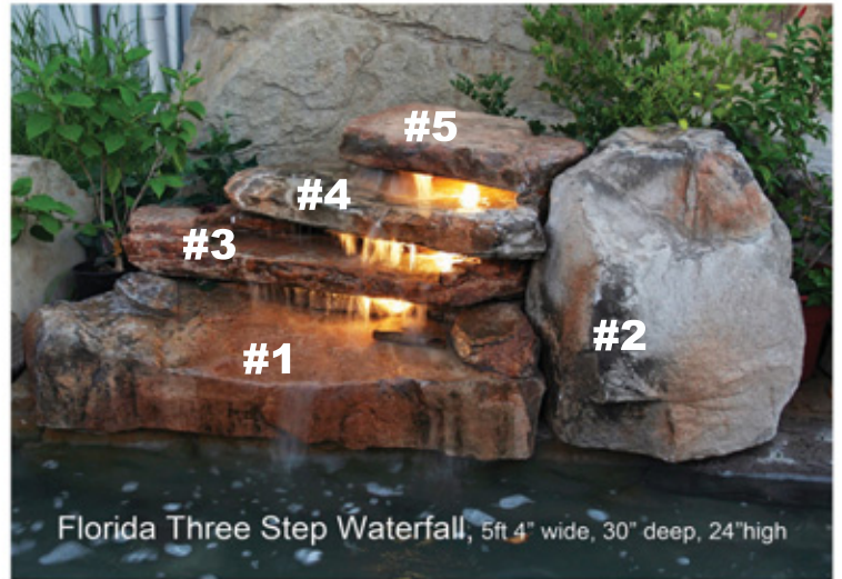
Florida Three Step Waterfall, 5ft 4" wide, 30" deep, 24" high

A simple waterfall for a pond, pool or pond less feature. Can be installed with mortar like our Modular Waterfalls or with Construction Adhesive as shown here.