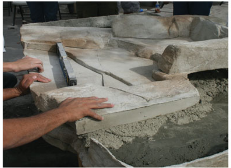
Set grotto top piece #7 in fresh concrete or mortar. It must be level and shape should match the grotto bottom piece. It will drain down when pump is off if set properly.