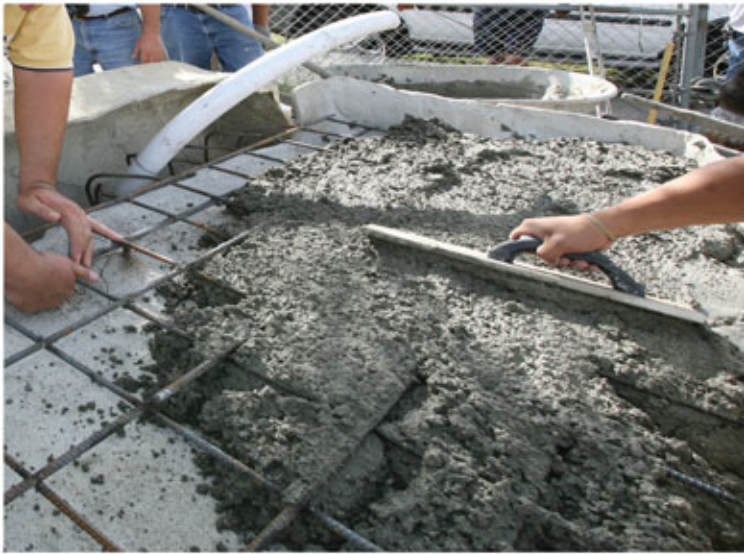
Fill back wall and top with concrete mix, 2000 psi or better. Top should be level. Requires about 1/2 yard of concrete mix.