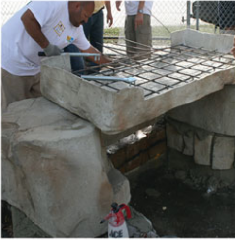
Set grotto bottom piece #6 Should be level from side to side.