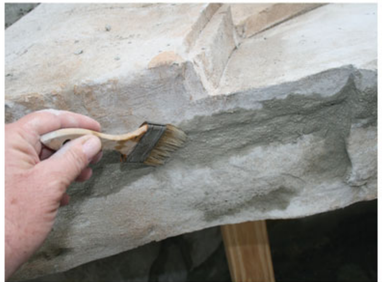
Finish seam between grotto bottom and top. Add accent colors to waterfall pieces. Set small rocks as desired or to divert waterflow. Color touch up after all mortar if dry.