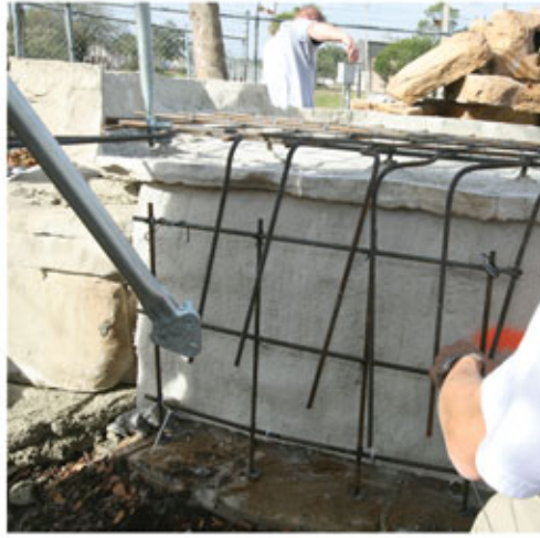
Splice rebar from grotto piece into rebar schedule from pool beam or footing.