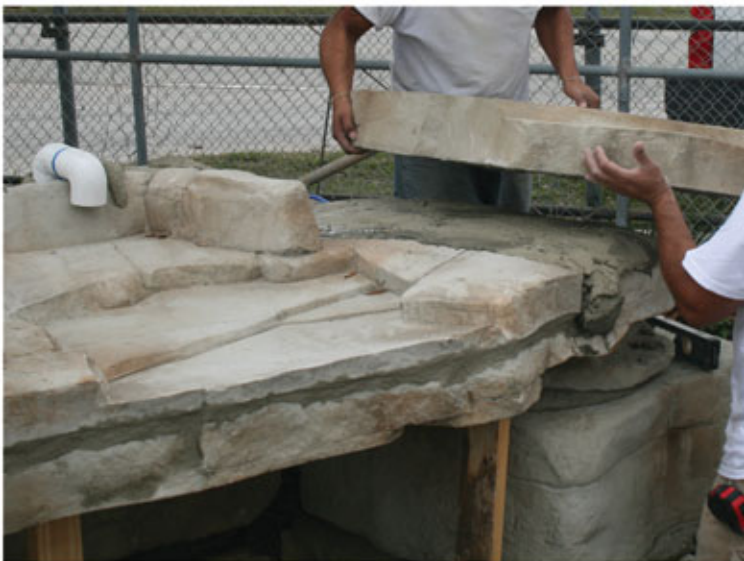
Add 2 inches of concrete fill on each side of grotto top and mortar in top rocks #8 and #9. Add two 90's to 2inch return line to discharge onto grotto top. Set cap rock #10 to hide pipe.