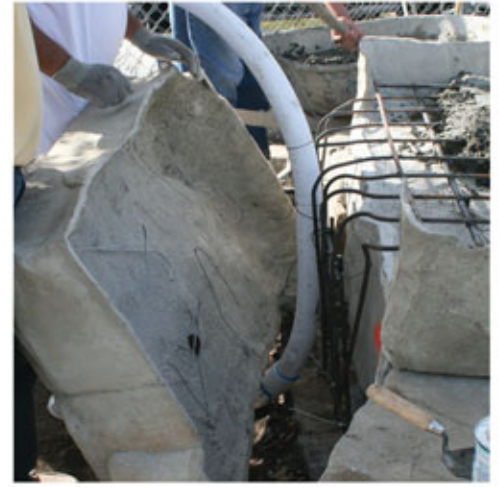
Extend 2 inch pvc plumbing before setting back casting #5. Also run sleeves for lighting.