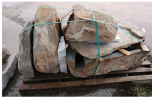
Kit comes palletized on a 7 ft skid. 5 cast rock pieces, weight 1,200 lbs