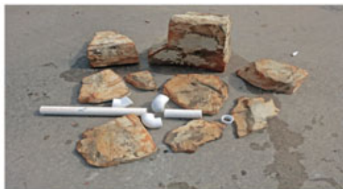
7 small cast pieces, 2" pvc for plumbing column and hollow rocks to hide pipes as shown below are included in kit. Three color options.