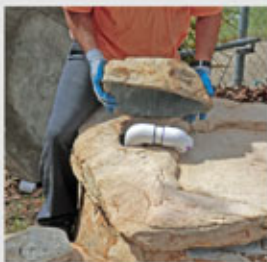
6" plumbing sleeve for 2" pipe should be filled with spray foam or mortar after pipe is set