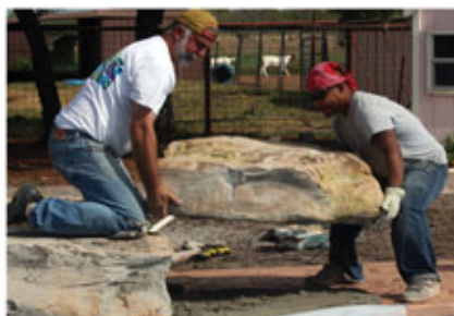
The heaviest piece is about 200 lbs. For pool installations it is recommended that all cast pieces be mortared to a concrete deck and mortared together. Small pieces can be secured with construction adhesive.